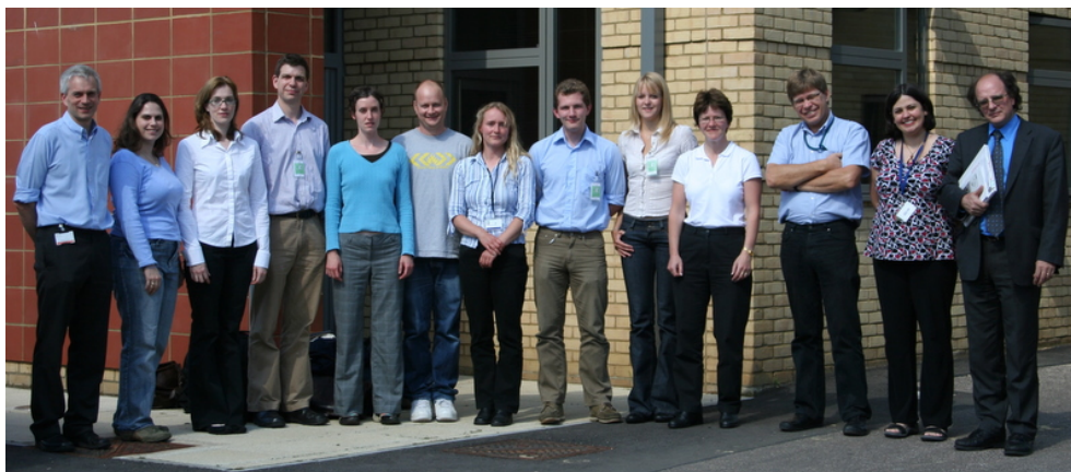
Figure 1 WikiVet Founding Members at RVC 2007

WikiVet was established in 2007 to provide online access to a comprehensive veterinary curriculum. The consortium was initially formed by three UK veterinary schools (RVC, Edinburgh and Cambridge) and was subsequently joined by Nottingham. It has now grown to include over 10 additional associated academic institutions as well as forming a close association with parts of the commercial veterinary sector. WikiVet now has a registered user base of over 35,000 members of whom about 60% are veterinary students from over 90 countries around the world.